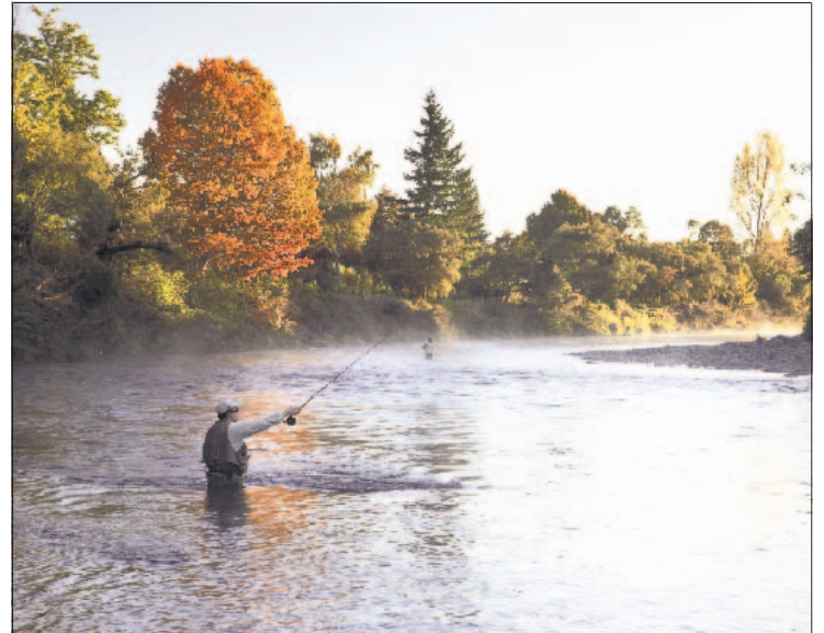
People come from the other side of the world to fish the rivers of Turangi.

keen fisherman, American Jason Bleibtreu, bought the property and transformed it into a luxury three-bedroom fishing lodge. The walls are all cedar and schist, the rooms plush and stylish, the gardens extensive and the deck perfect for summer-evening drinks. And in winter guests can't resist the lure of the huge fireplace.