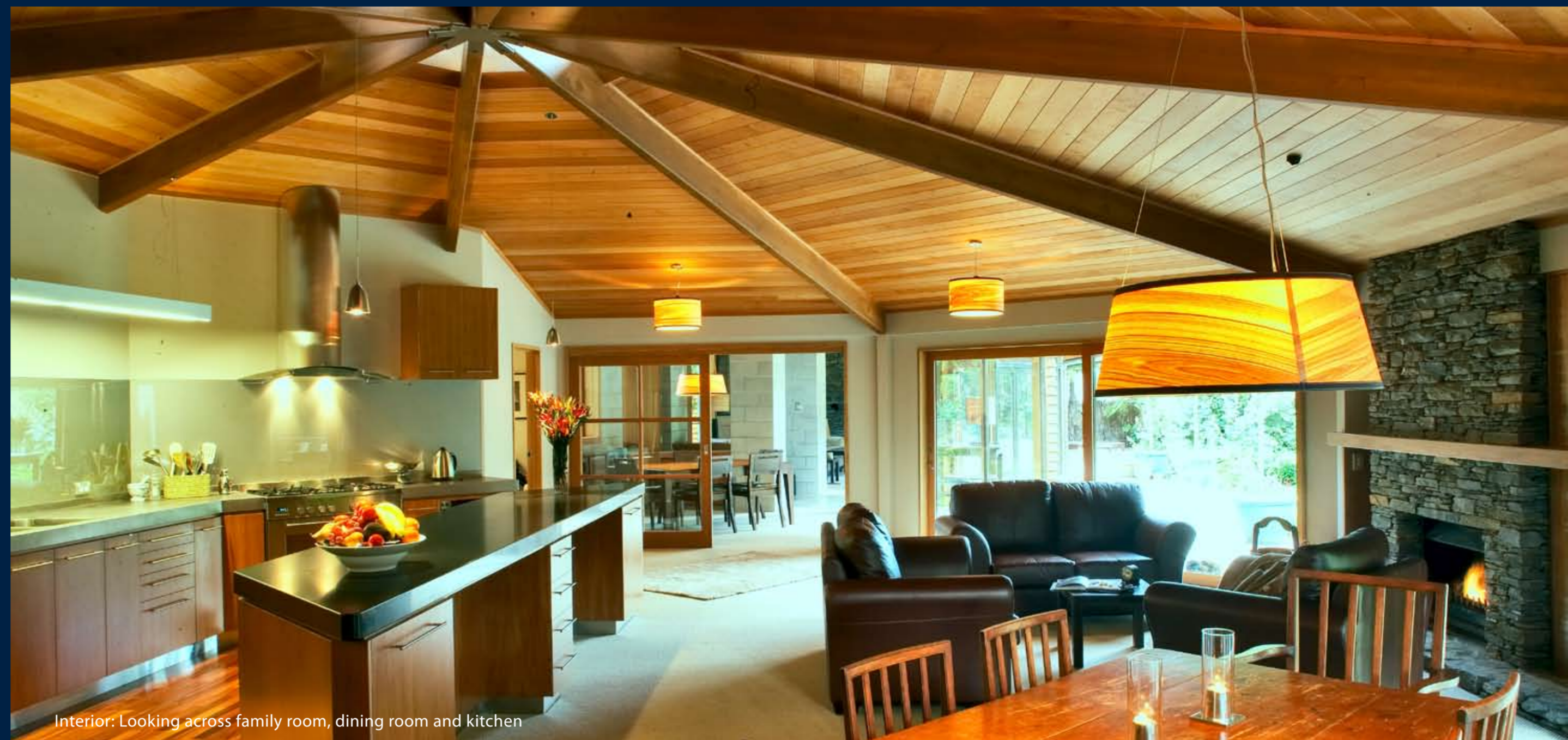
Interior: Looking across family room, dining room and kitchen