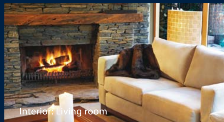
Interior: Living room