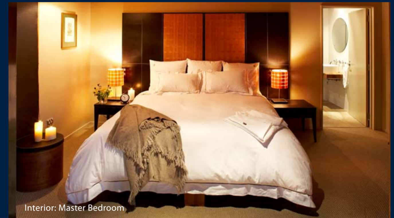
Interior: Master Bedroom

The extensions have been clad in cedar as has the existing Lockwood enabling insulation to be provided to those walls. The brief was to provide an understated elegance to a New Zealand experience for keen trout fishers and the achievement is appreciated by the owner and visitors alike.