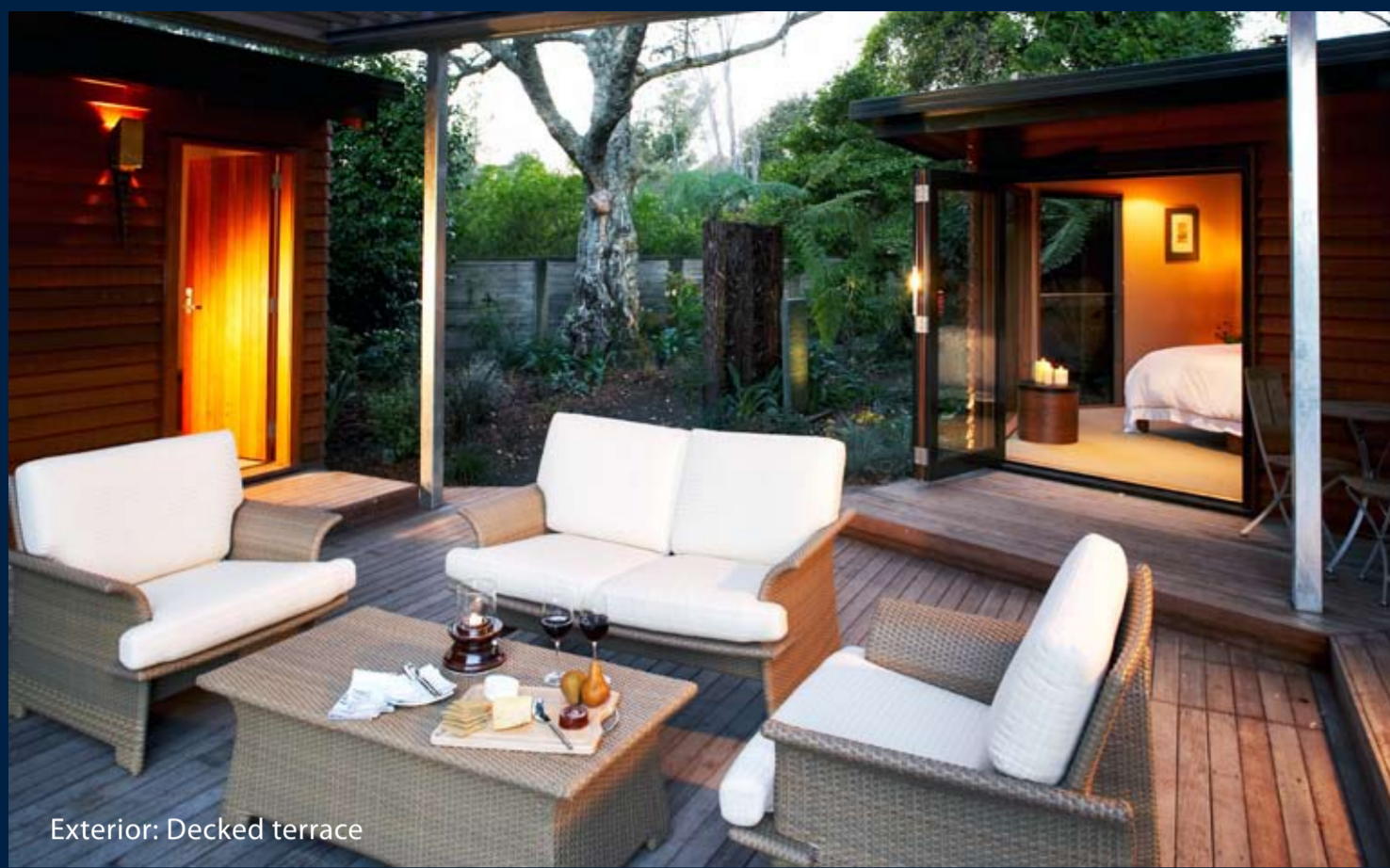
Exterior: Decked terrace