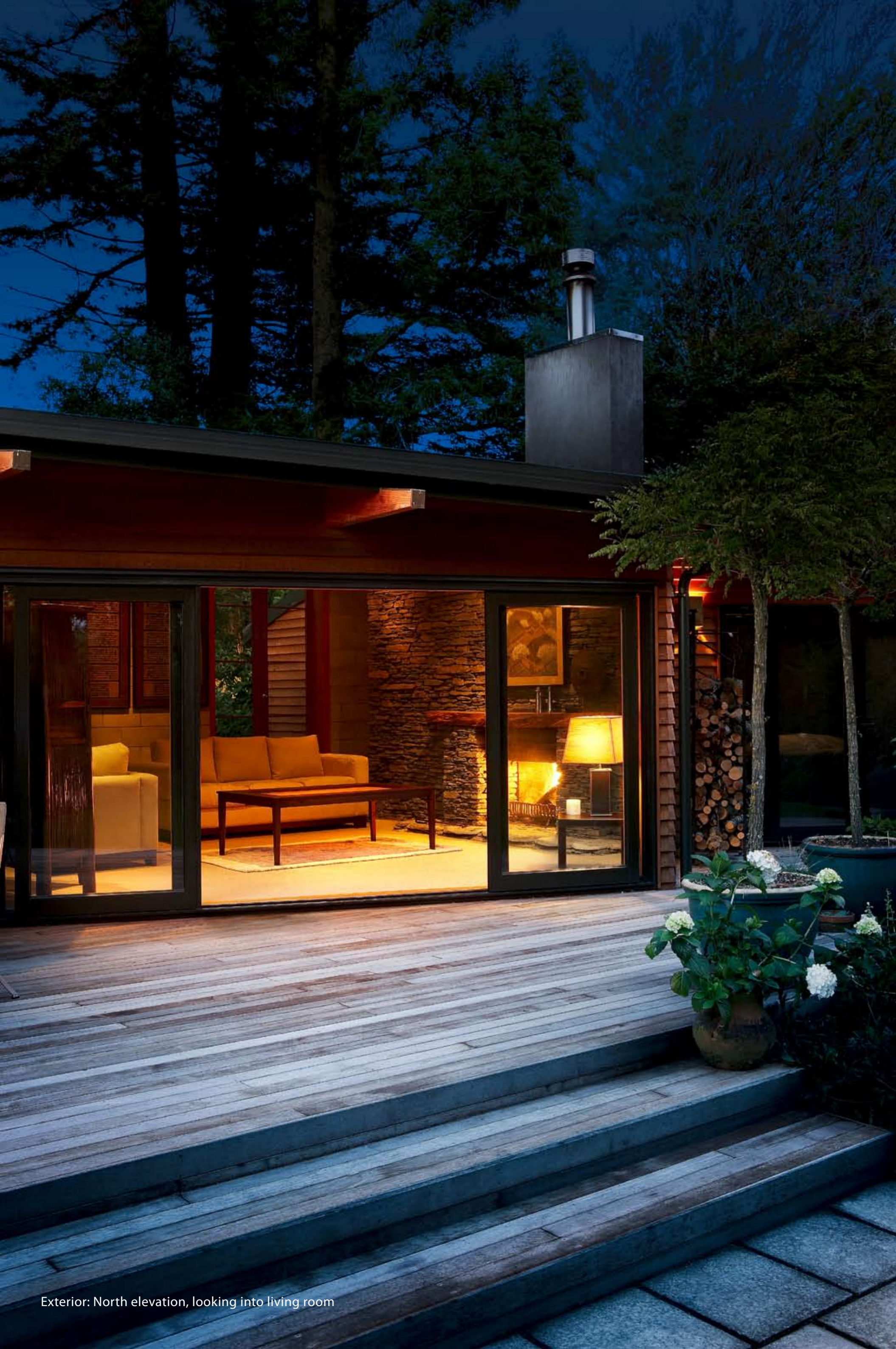
Exterior: North elevation, looking into living room